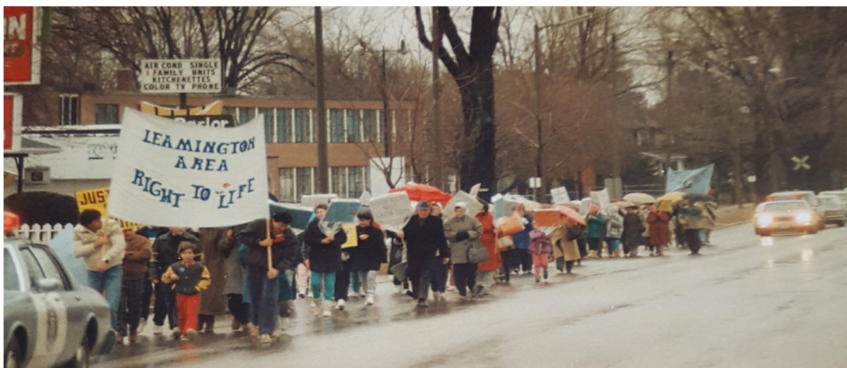
Pictured above: supporters and members of Leamington Area Right to Life, escorted by police, walk to Leamington District Hospital.