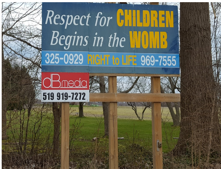
Above right: this colourful but simple sign on County Road 20 west of Kingsville was visible from 2016 to 2020.

Soft Fetal Models were purchased from Alliance For Life 1992.